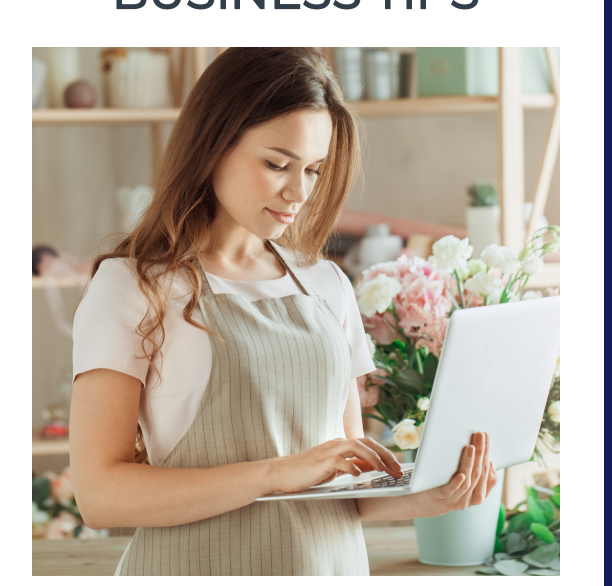
4 Ways to Stand Out as a Small Business in a Crowded Space

The past year has undoubtedly demanded pivots and change in more ways than anyone could have imagined. Businesses were catapulted into endurance mode with a singular focus: survival.